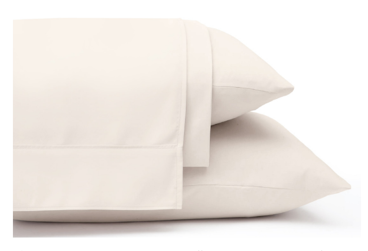
Sheets Sets in Twin, Twin XL, Full, Queen, King or Cal. King Standard or King Pillowcases