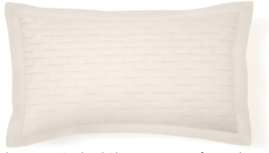
Standard or King Quilted Shams in one of two clean, contemporary patterns